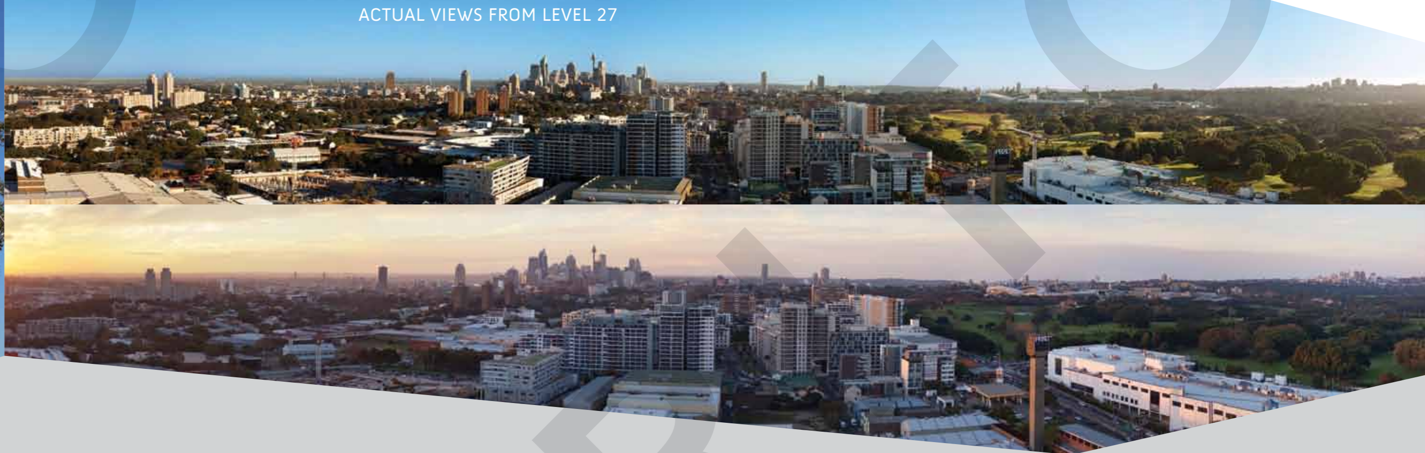
ACTUAL VIEWS FROM LEVEL 27